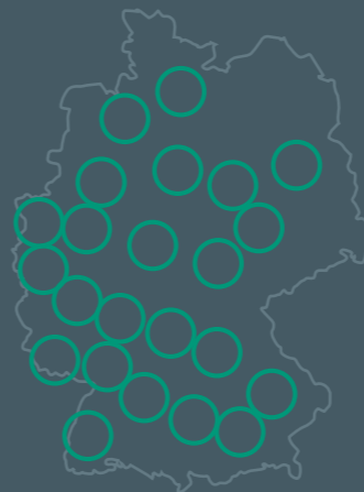
The 23 logistics regions in Germany

Our comprehensive analysis of logistics attractiveness and intensity of Stadtkreise (autonomous cities) and Landkreise (districts) across Germany identifies a total of 23 logistics regions, some of which differ quite considerably in terms of logistics structure and the state of the logistics real estate market.